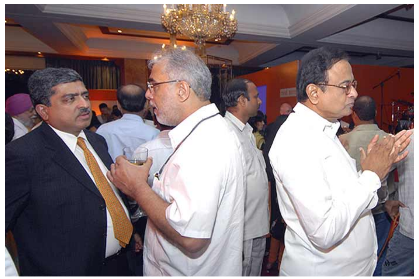
Nilekani vs Chidambaram? The UID's data collection irks the home minister